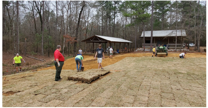
2020 Wischixin Field Sod Party