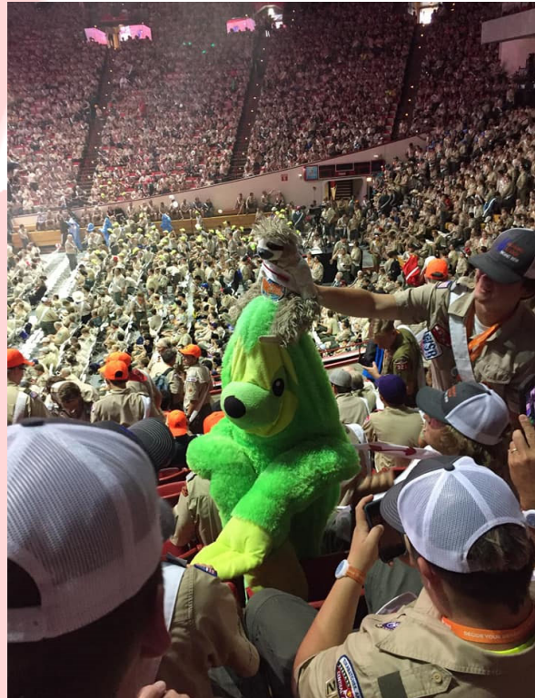
Super arena shows with 7,500+ Arrowmen are held each night of NOAC