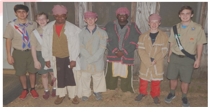
Our call out team for the Towassa Chapter did a great job!