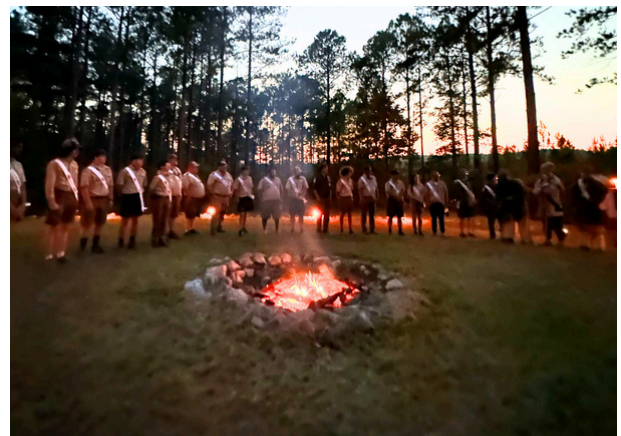
The lodge hosted an Ordeal Ceremony at Camp Tuk on August 2-4 for seven OA candidates.