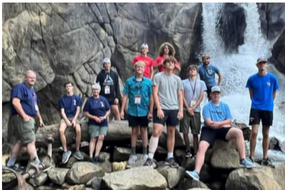
The Alibamu contingent explored Boulder, Colorado, during NOAC to "Seek New Heights."