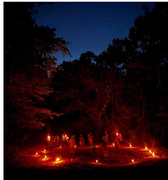
The pre-Ordeal candidates approach the ceremony ring at Pilgrimage Ordeal in August at Camp Tukabatchee.

Whether you've volunteered before or not, we would love for you to help the Cub Scouts have an amazing weekend and enjoy all the spooky activities that come with it! Along with cheerful service, we will have time with the lodge playing games and the infamous pumpkin-carving competition on Friday night. Registration information will be on the council's website soon.