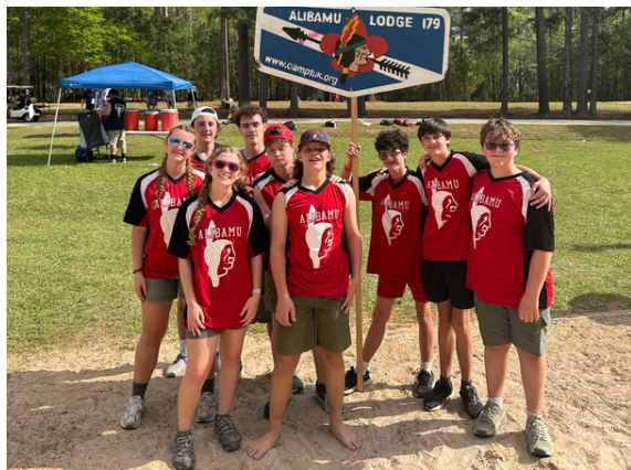
Alibamu's volleyball team led other lodge's in every volleyball game they played.