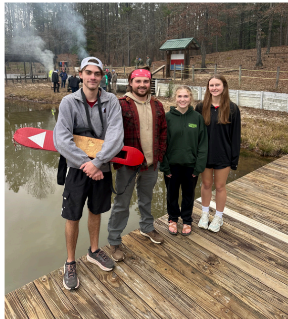
The aquatics team (all OA members) supported the Yeti Plunge at winter camp.