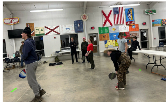
Campers played pickleball on the last night of winter camp in the dining hall.

While the temperature outside was dropping, the Lodge was just heating up. Campers spent their last night dodging the chill with a steaming hot chocolate station, leaving their mark at the branding station, and battling it out over games. It was the perfect, cozy send-off to an unforgettable weekend!