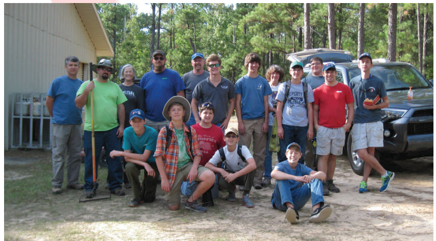
2015 One Day of Service Participants