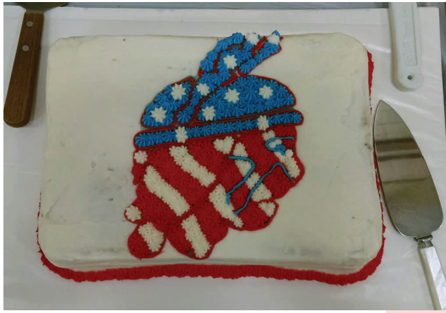
100th Anniversary Cake!