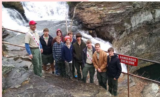
The SWAG contingent made a stop at Desoto Falls

The brothers on the trip attended several training sessions geared towards crafts, ceremonies, and AIA. Personally I enjoyed classes on the new Brotherhood ceremony, Ordeal management, and teepee set up. Hopefully the lodge's teepee will be appearing at Scout events as many brothers of our contingent attended the class. The weekend was filled with fun, excitement, and fellowship. Alibamu is looking forward to SWAG 2016 at Camp Thunder.