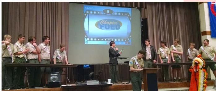
Chapter Feud at the 2015 banquet - Chilitauga beat the "others"

The underlined portion is the new text. These chairmen have been ad hoc members of the LEC for many years. It is now time for them to become full voting members. A vote is scheduled to take place at the Allogagan Ordeal in May.